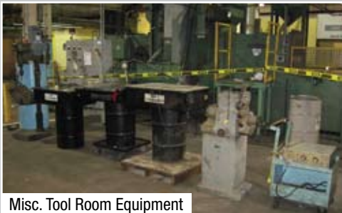
Misc. Tool Room Equipment