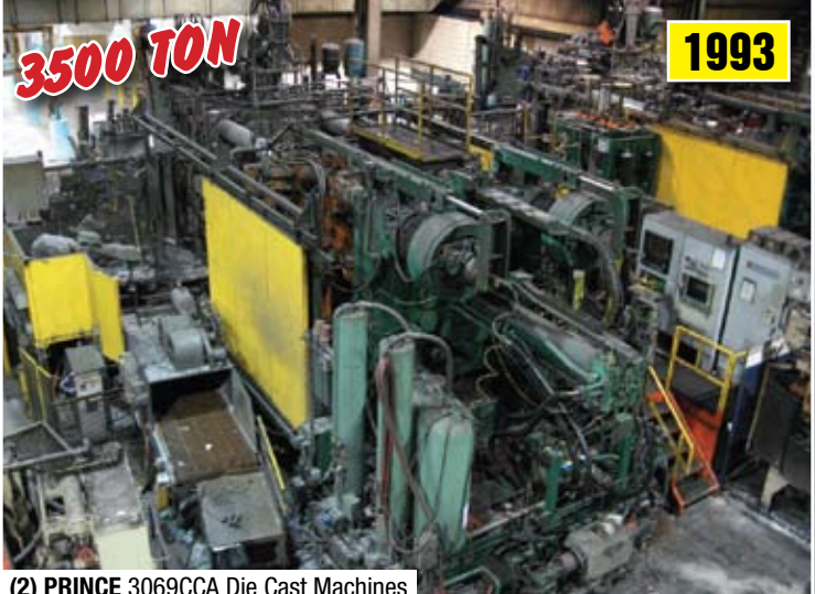
PRINCE 3069CCA Die Cast Machine