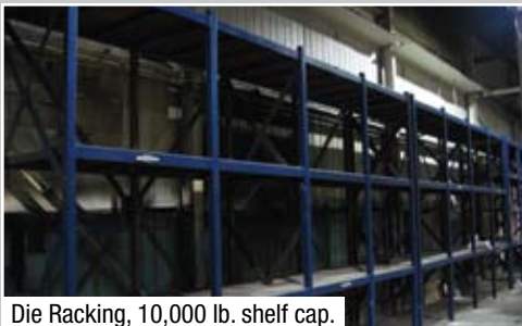
Die Racking, 10,000 lb. shelf cap.