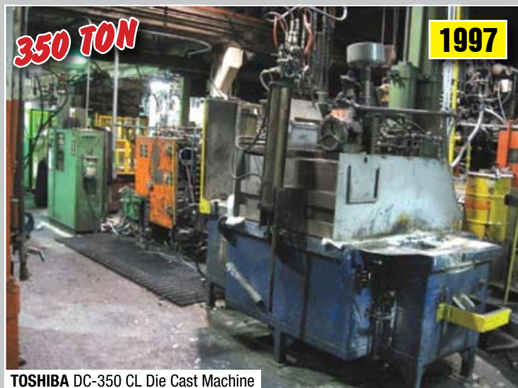
TOSHIBA DC-350 CL Die Cast Machine