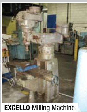
EXCELLO Milling Machine