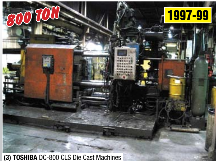
(3) TOSHIBA DC-800 CLS Die Cast Machines