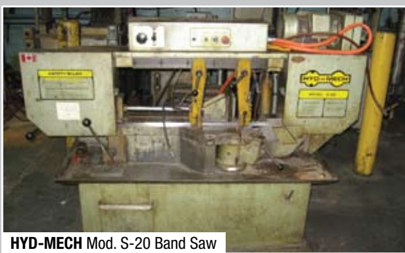
HYD-MECH Mod. S-20 Band Saw