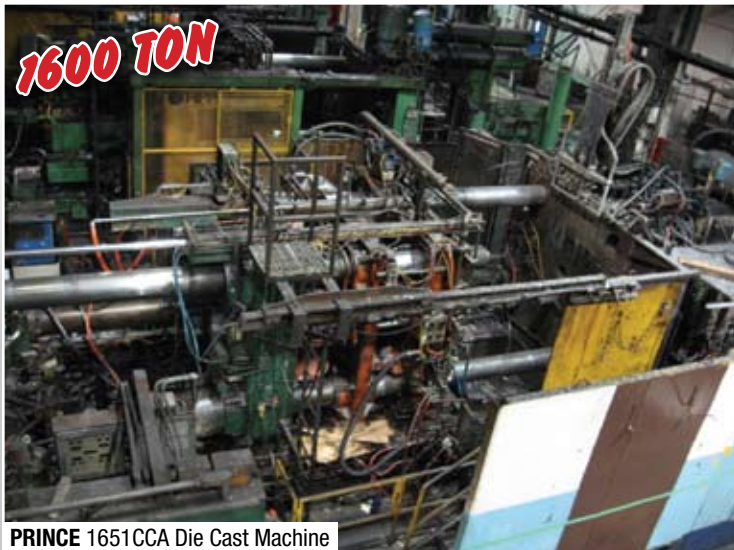
PRINCE 1651CCA Die Cast Machine