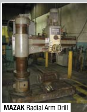
MAZAK Radial Arm Drill