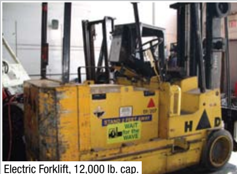
Electric Forklift, 12,000 lb. cap.