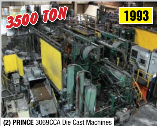
(2) PRINCE 3069CCA Die Cast Machines

FEATURING: (18) DIE CAST MACHINES • PRINCE • TOSHIBA • HPM UP TO 3500 TON