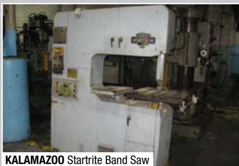
KALAMAZOO Startrite Band Saw