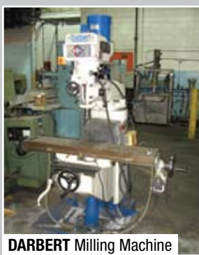
DARBERT Milling Machine