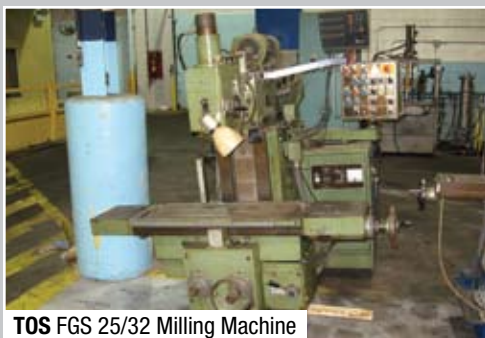
TOS FGS 25/32 Milling Machine