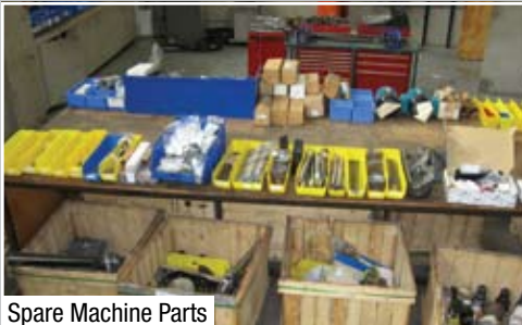
Spare Machine Parts