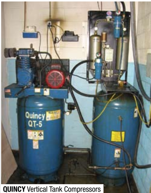
QUINCY Vertical Tank Compressors