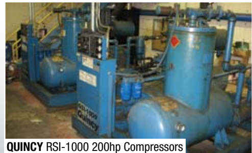
QUINCY RSI-1000 200hp Compressors