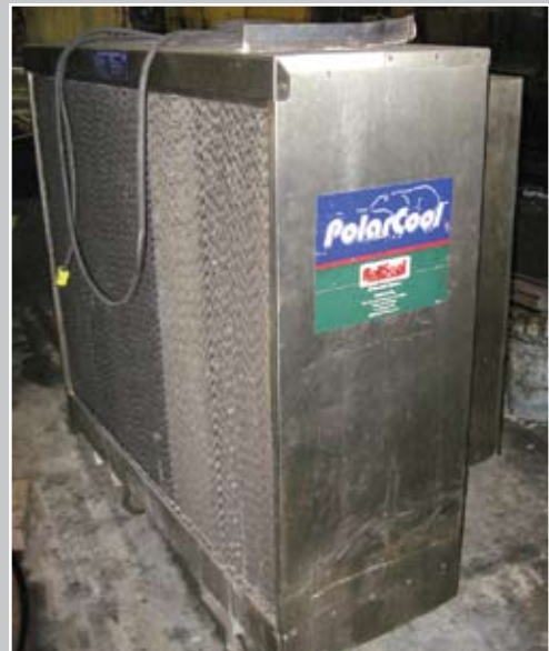
ROLL SEAL Polar Cool Cool Mist Machine