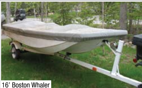
16' Boston Whaler