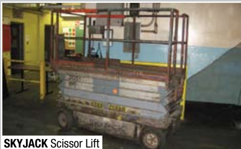
SKYJACK Scissor Lift