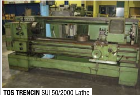
TOS TRENCIN SUI 50/2000 Lathe