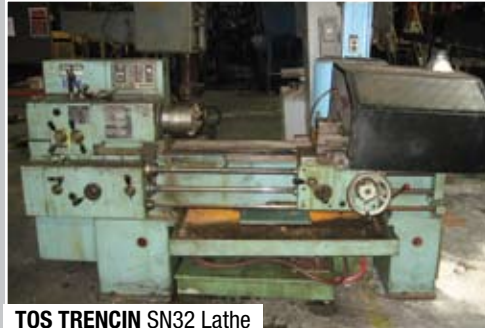
TOS TRENCIN SN32 Lathe