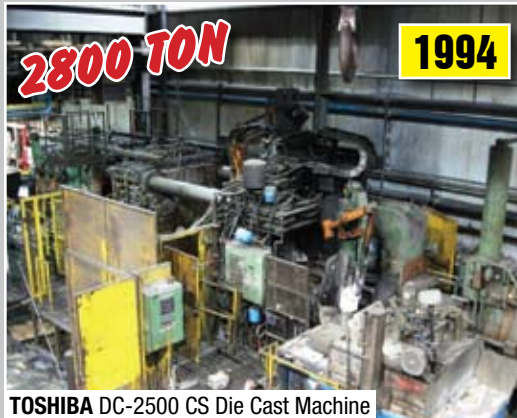
TOSHIBA DC-2500 CS Die Cast Machine