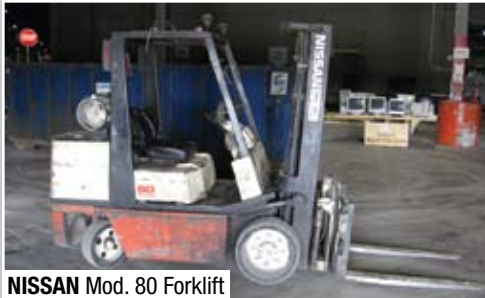
NISSAN Mod. 80 Forklift