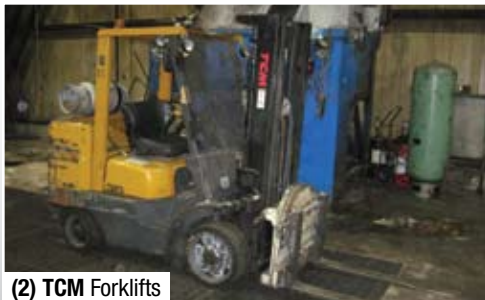
(2) TCM Forklifts